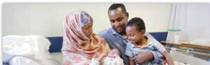
Information for Mums-to-be and their partners

Come and find out more about the range of services that we offer: From Holistic Integrated Pregnancy Care, to Birth Centre, High Risk Obstetric Care, Caesarean Sections and Perinatal Mental Health