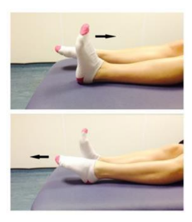
Point your foot up and down. Repeat this 10 times.

Do these exercises three to four times a day. Start straight away, you do not need to push into pain.