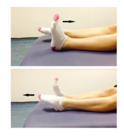
Point your foot up and down. Repeat this 10 times.

Do these exercises 3-4 times a day. Start straight away, you do not need to push into pain.