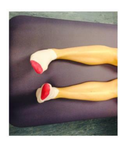
3. Make gentle circles with your foot in one direction and then the other direction. Repeat this 10 times.