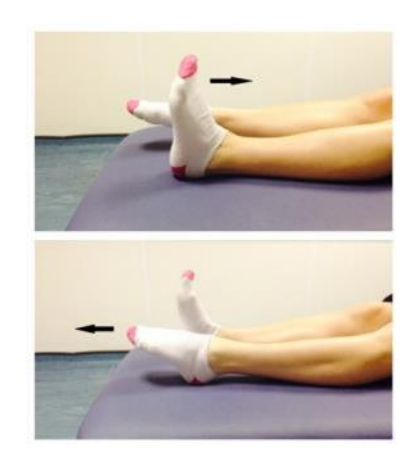
Point your foot up and down. Repeat this 10 times.

Do these exercises 3-4 times a day. Start straight away, you do not need to push into pain.