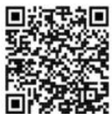
Fever/ High Temperature