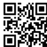
Viral Induced Wheeze