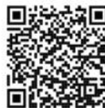
Diarrhoea and vomiting