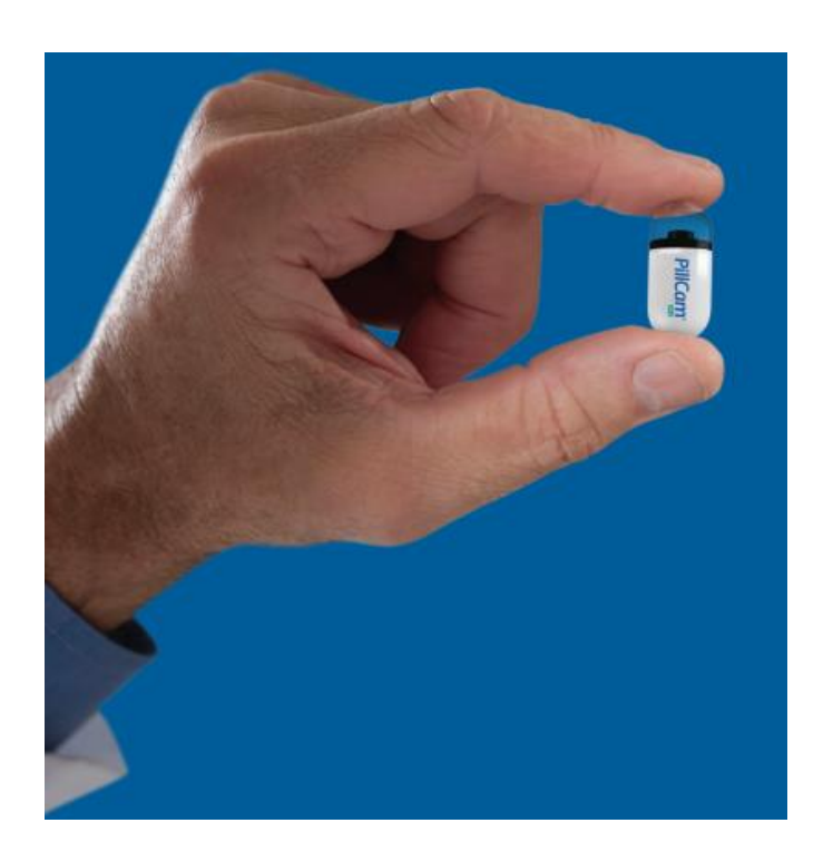
Figure 1: Small Bowel Capsule

It may not answer all your questions, but you will have the opportunity to further discuss the test when you are assessed for the procedure.